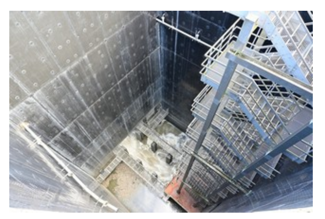
Emschergenossenschaft's very impressive Pumping Station in the Emscher Catchment

IKT to take part in €4M Horizon 2020 project to build collaborative Urban Drainage research labs communities