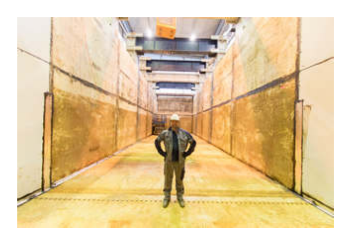
IKT large test facility, an 18m x 6m x 6m floodable test chamber for 1:1 scale underground infrastructure evaluation

Guests also viewed the IKT large test facility , an 18m x 6m x 6m floodable test chamber for 1:1 scale underground infrastructure evaluation. This is currently being prepared to host LinKa project test rigs to determine how complete CIPP systems (liner, manhole end seals and later connection repairs against groundwater pressure.