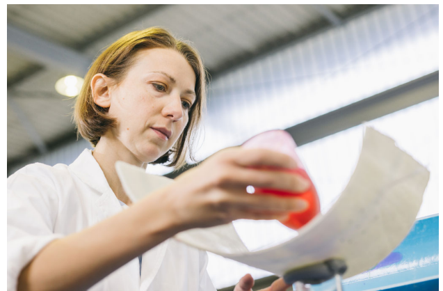
Water tightness test with red dyed water

Then you will receive an expert test report that can give you peace of mind.