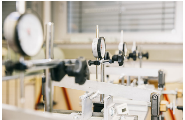
Rig for long-term tests

We have been conducting quality tests on CIPP liners for more than 25 years and for which we have a strong reputation.