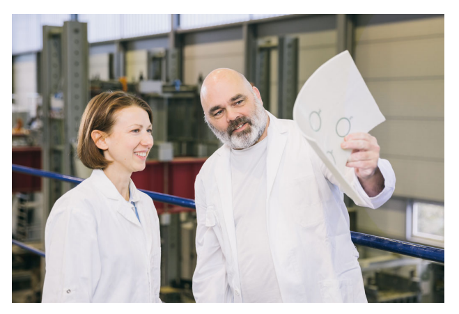
Initial assessment of a CIPP sample: searching for weak spots