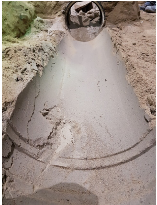
Pipe enclosure with minor defects (DN 300)

Materials that failed key performance or environmental criteria were ruled out for sewer construction use.