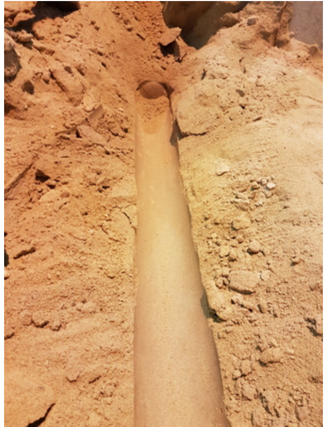
Pipe enclosure without defects (DN 100)