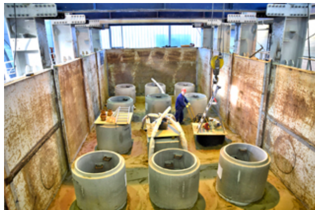
Comparative product tests: IKT puts building products through their paces