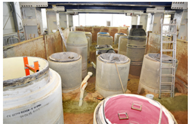
IKT's large-scale test rig for 1:1 scale tests