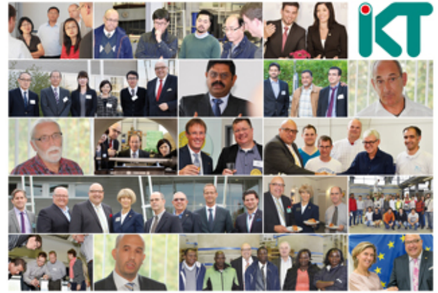
IKT's international friends