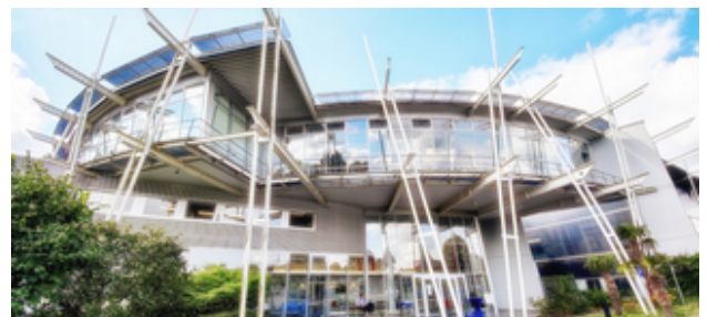
IKT – Institute for Underground Infrastructure