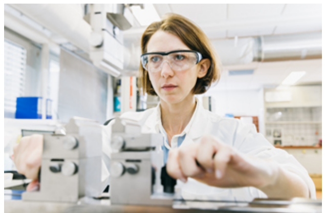
Neutral and independent: CIPP

IKT operates two testing laboratories for material and construction product testing. Both are recognised by the German Institute for Building Technology (DIBt).