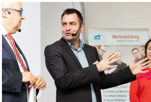
Knowledge works: Continuing education in IKT

Due to increased heavy rainfall and because rainwater is to be infiltrated and stored, the testing centre has already extended its accreditation to infiltration products. All DIBt approval tests required for this can now be carried out at the IKT.