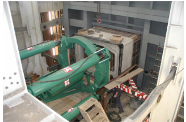
IKT tests jacking pipe with rectangular cross-section in its large-scale test rig

In its first five years, IKT initially focussed on research into geophysical subsoil exploration, pipe jacking, sewer gasses, infiltration and tree root ingrowth. The Institute also took up the topics of pipe and manhole rehabilitation at an early stage.