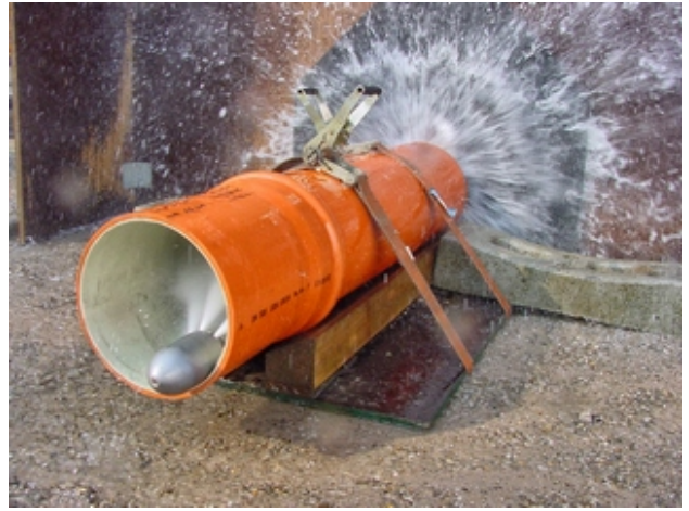
High-pressure jet resistance and rinsing resistance