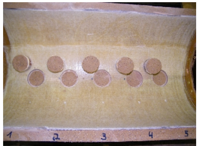
Tensile-adhesion testing of short-liners

Short lengths of selected repair systems were tested under external water pressure to examine their potential for sealing pipes against groundwater pressure. Comparative tensile-adhesion tests were undertaken using four short-liner systems on eleven different surfaces in order to determine the factors influencing performance and any need for surface preparation when refurbishing using short-liners.