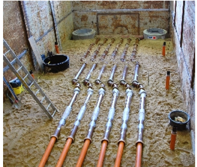
6 x 6 pipes: Layout of the test lengths in IKT's large-scale test facility