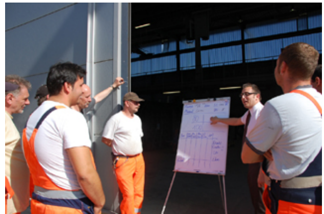
Discussing measured data: How efficient is the sewer flushing vehicle?

enhancement of efficiency have been elaborated in this research project. A large number of workshops and working meetings with sewer-system operators from all over Germany have been held to facilitate these changes for system operators. These provided an opportunity to compile and discuss the operators' problems, wishes and requirements, and their experience with the use of various cleaning strategies. These findings have been compiled to provide other system operators with assistance in the optimisation of their own cleaning strategy.