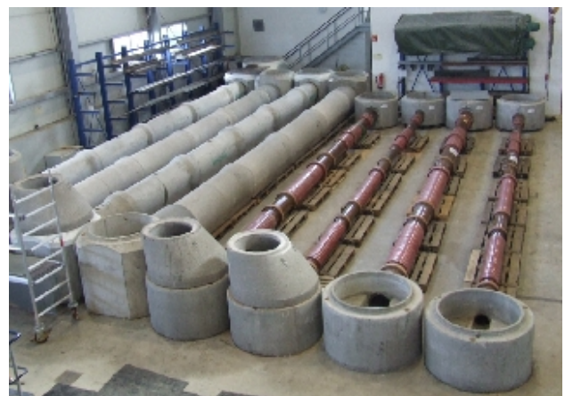
Layout of the test lengths: Pipes with built-in faults

Many waste-water system operators are unsure of what can be achieved by main sewer repair methods and what quality is attainable. Twelve different techniques from the three groups of methods: “Injection/grouting + injection methods”, “Short-liners” and “Internal sleeves” have been comparatively tested under defined and replicable conditions using the IKT Comparative Test “Repair methods for main sewers”. The principal focus was the testing of the techniques in IKT test rigs under conditions approximating to actual practice. The IKT Comparative Test provides reliable and impartial information on the quality of the techniques tested and