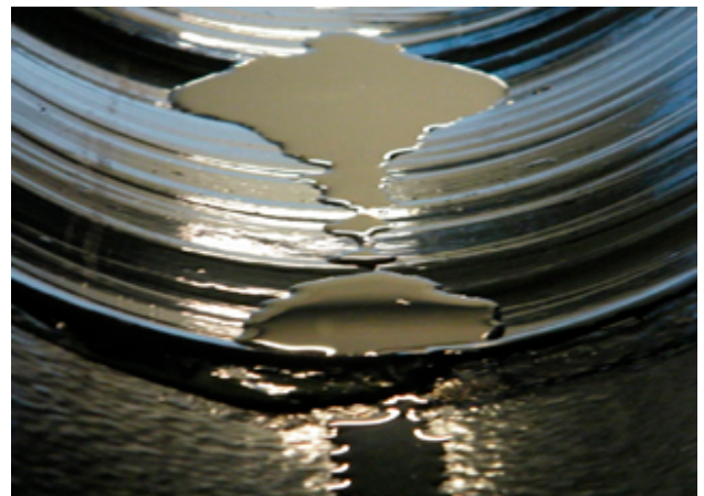
External water-pressure test indicating ingress of water