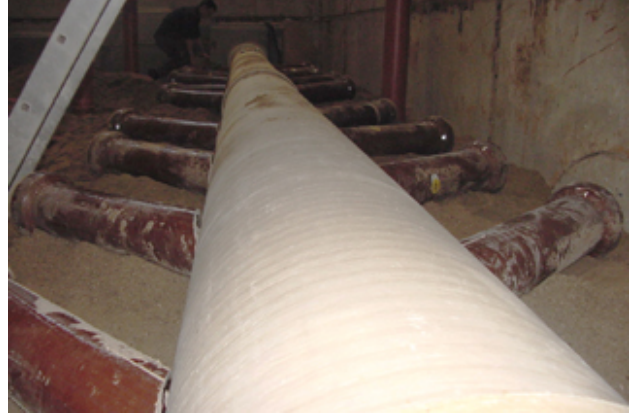
Repair of Lateral Connections

Testing Top Hat Liners and Robotic Systems for Repair of Lateral Connections