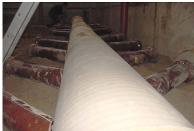
Repair of Lateral Connections

Testing Top Hat Liners and Robotic Systems for Repair of Lateral Connections