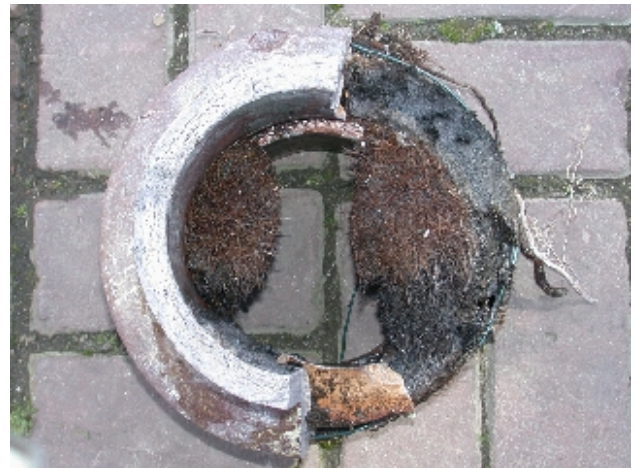
Pipe joint exhibiting severe root intrusion

Measures to prevent root intrusion into waste-water conduits, drains/sewers and manholes are to be assessed and recommendations for action derived to assist engineering consultancies involved in the planning of networks.