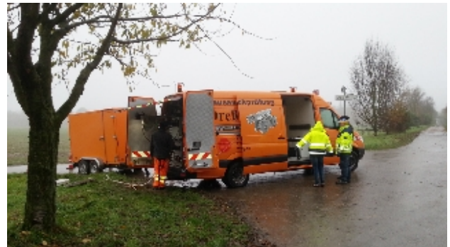
Field research: Inspection of a pressure pipe

This is a two Phase project examining the inspection and condition-surveying of pressure sewer pipes and culverts.