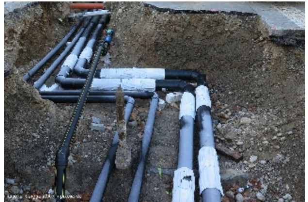
Open-trench installation of district-heating piping

Ever greater importance is being attached to the expansion of district-heating networks as energy development progresses. Costs can be saved and resources conserved by installing new piping systems using trenchless technologies.