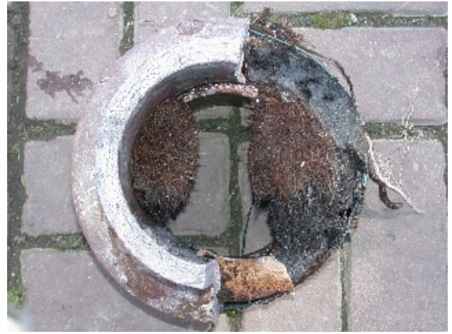
Pipe joint exhibiting severe root intrusion

Measures to prevent root intrusion into waste-water conduits, drains/sewers and manholes are to be assessed and recommendations for action derived to assist engineering consultancies involved in the planning of networks.