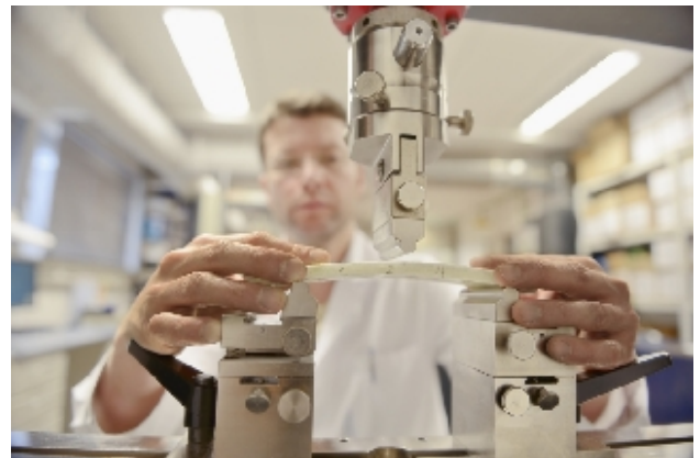
Three-point bending test on a CIPP-Liner

One special focus is the evaluation of cured-in-place (CIPP) liners for sewer networks. The IKT Test Centre publishes data on the performances of both CIPP liners and contractors each year in its IKT LinerReport.