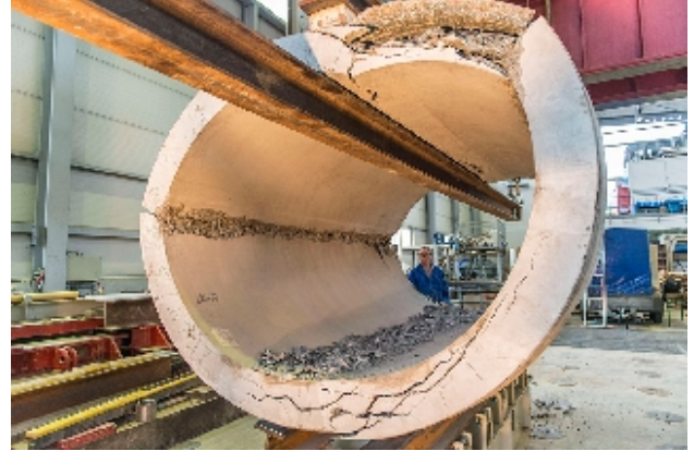
Vertical compression test on a reinforced-concrete pipe

The IKT Test Centre for Building Products is a testing, supervisory and certification body accredited with the German Institute for Construction Technology (DIBt) in Berlin in accordance with European Standards (DIN EN ISO/IEC 17025 ( Accreditation )). This covers selected mechanical and technical tests for polymeric components of pipe and CIPP liner systems, and for GRP laminate . This assures for our customers an extremely high level of technical expertise, combined with IKT's strict independence and impartiality.